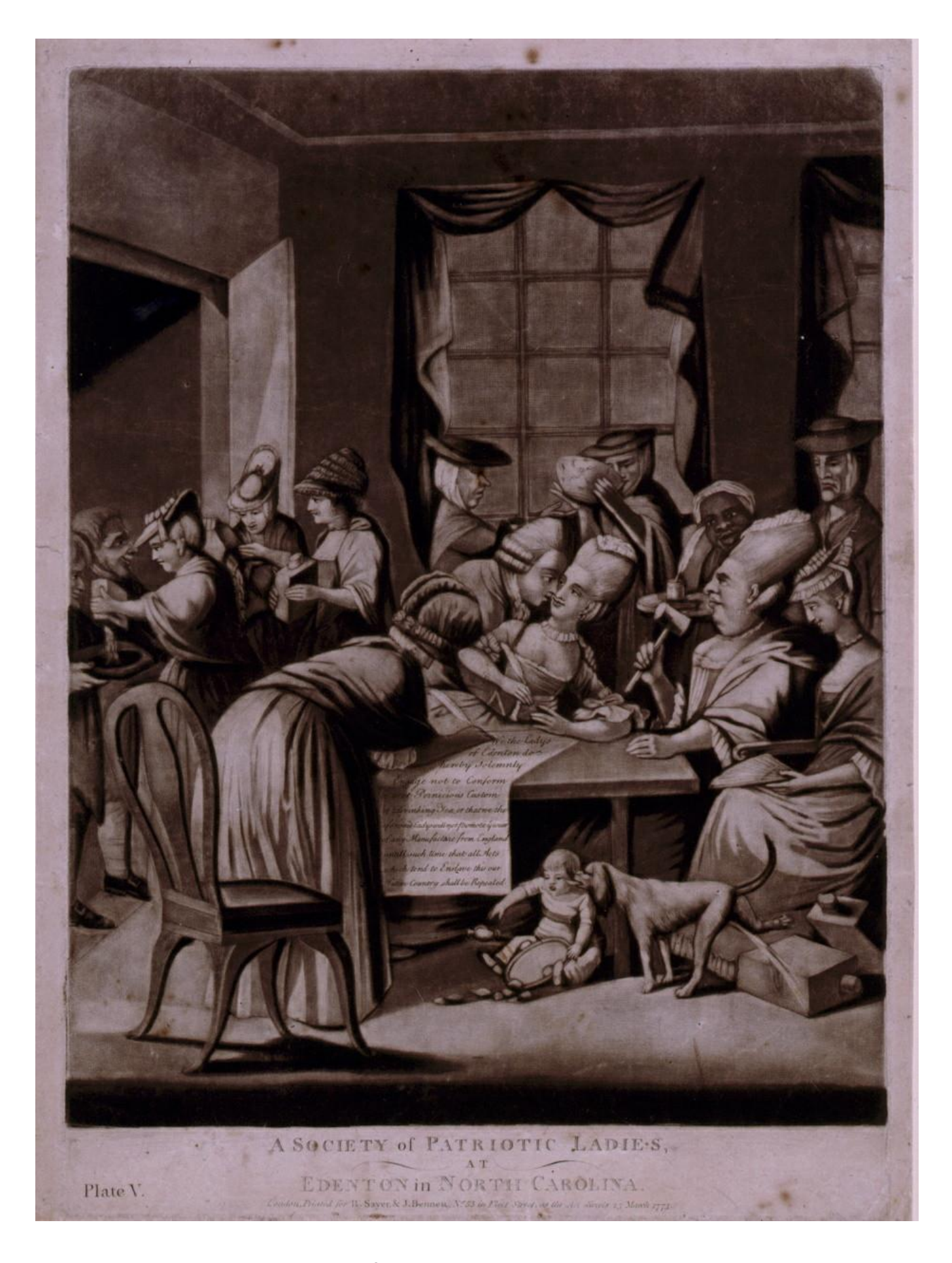
A Patriotic Society of Women at Edenton in North Carolina