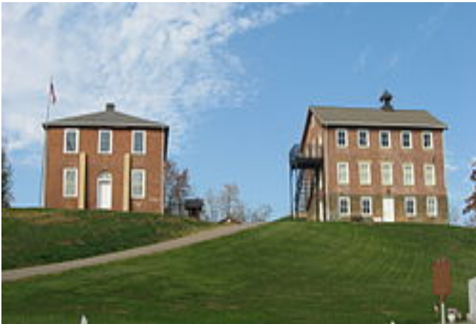
The Old Chester Courthouse and Academy - Chester, Ohio