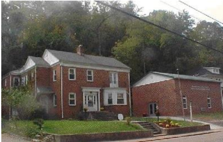
MEIGS COUNTY MUSEUM AND ANNEX

The Meigs County Museum is owned and operated by the Meigs County Historical Society.