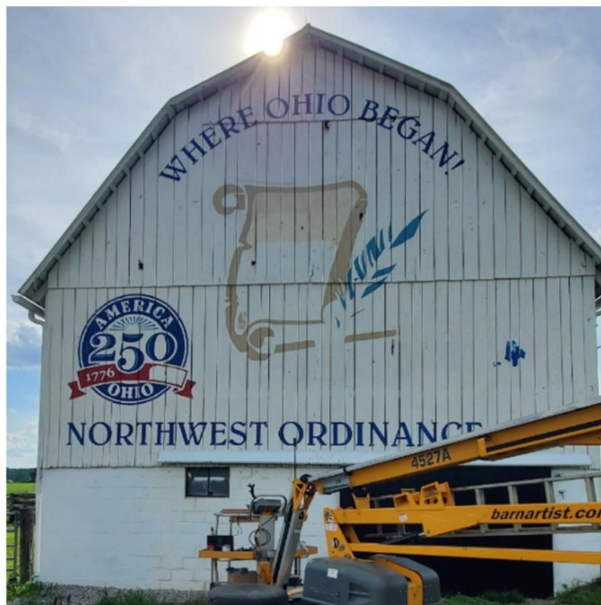
America 250 th barn being painted in Coolville (June 2025)