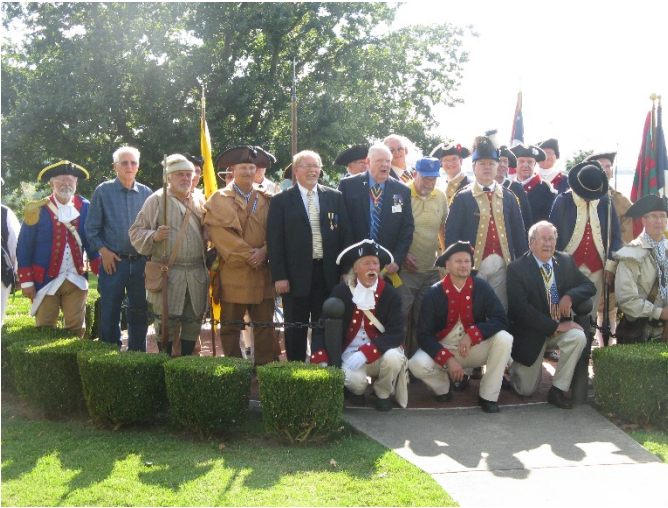
Ohio SAR members - Battle Days Wreath Laying Ceremony