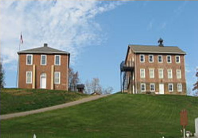
The Old Chester Courthouse and Academy - Chester, Ohio